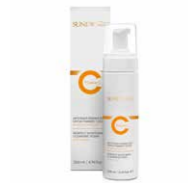
Active Petal Mask