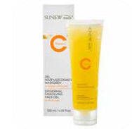
Epidermal Dissolving Gel